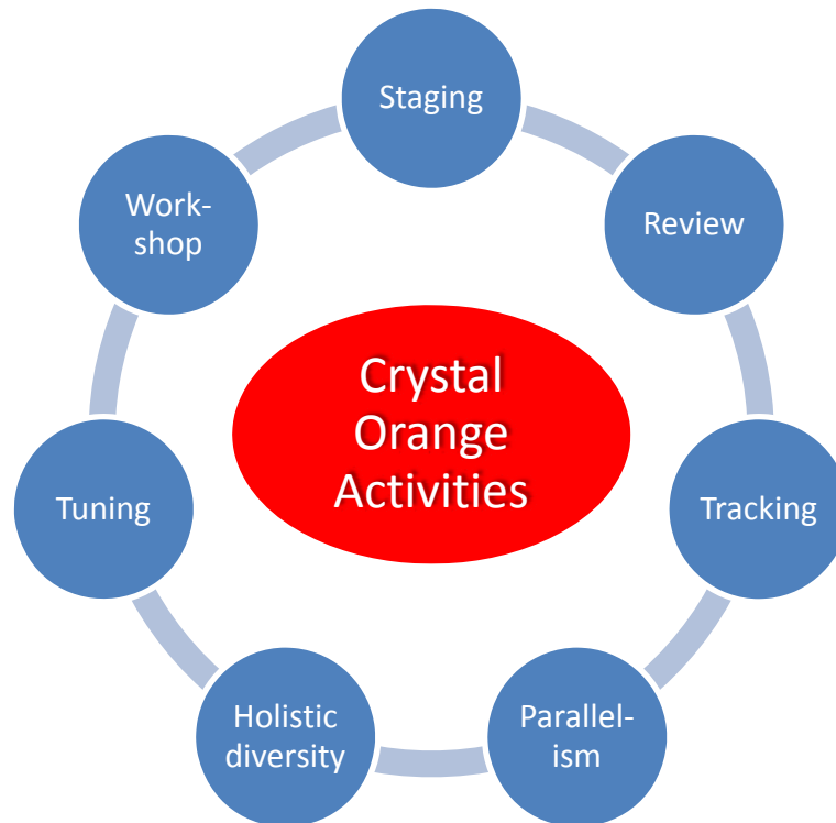
Figure 2: Crystal Orange Activities

A Crystal Orange increment includes activities, such as staging, monitoring, reviewing, parallelism, holistic diversity strategy, methodology tuning, and reflection workshop. These are illustrated in figure2.